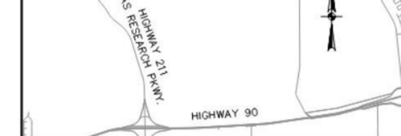
LOCATION MAP NOT-TO-SCALE